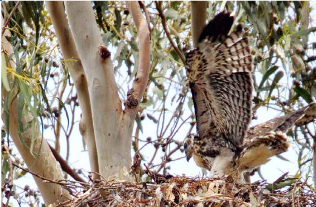
A local young hawk nearly size of an adult, by end of May, jumping to branches, flexing the flight muscles, strengthening the feet and talons. Lifting off of branches, testing the wings.